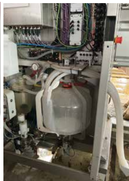
Left: Ceaglske and Graff in the milk tank room where the milk is stored until it's picked up by the haulers. Center and right: Robotic milkers modernize and streamline the milking process.