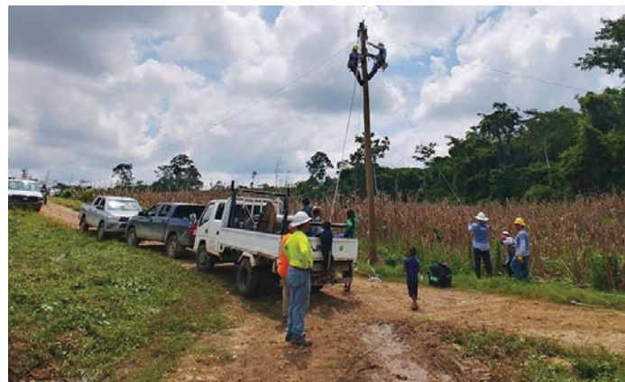
Wisconsin's electric cooperatives participated in an NRECA International project Partners for a Brighter Tomorrow,

Through the SUNDA project, electric co-ops were able to collect data and case studies that provide insight into challenges and solutions related to solar energy technologies. Now, electric cooperatives across the country, including Taylor Electric, have access to a set of knowledge and resources to more efficiently tailor our renewable energy mix to meet the needs of our local communities.