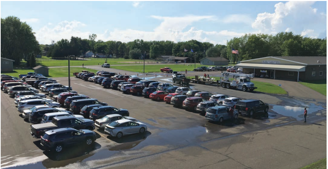
After a damp morning, the weather cooperated in time for Taylor Electric’s second drive-in style annual meeting, on June 29. More annual meeting coverage can be found on the following page.

If you have thoughts of running for the board or participating in the nominating committee process, an opinion on whether or not we should keep up the drive-in format for the meetings, or any other thoughts, questions, or concerns, feel free to contact me at the office, or visit with one of your board members.