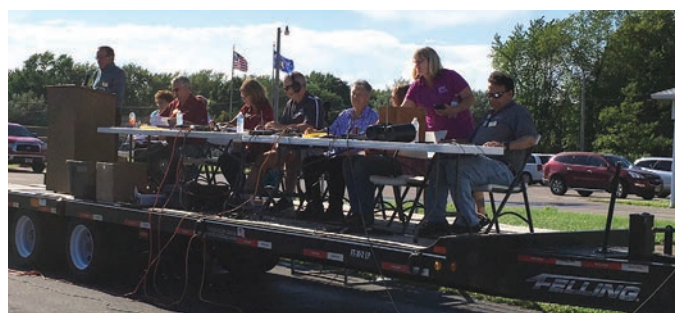
The annual meeting was held drive-in style once again for public safety, with members remaining in their cars for registration (left) and the podium set up outside on a truck bed (above).