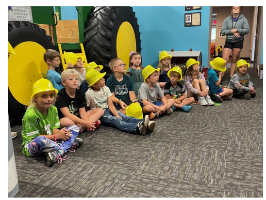
The perfect sized group to learn about electricity. Each child received a safety hat!